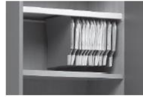
Archiving system with folders under Metal shelves. / Système d'archive avec dossiers suspendus en dessous des étagères métalliques.