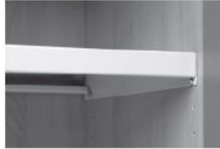
Shelves with high quality metalwork. / Étagères avec visserie métallique de haute qualité.