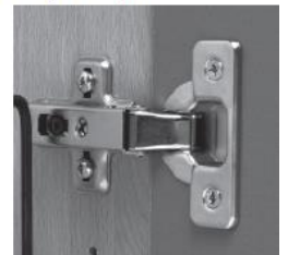
Adjustable hinge in horizontal and vertical. Soft closing system. / Charnière réglable en horizontal et en Vertical. Système soft closing