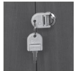
Possibility of master key. / Possibilité de passe-partout.