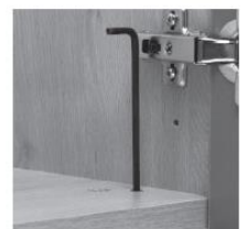
Inside access for levellers regulation. / Accès intérieur pour réglage des vérins.