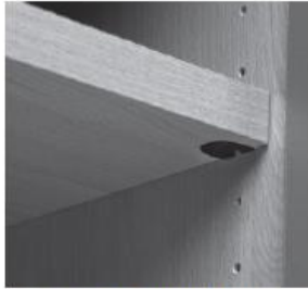
Shelves adjustment to the pin hole. / Étagères réglables le long de la crémaillère.